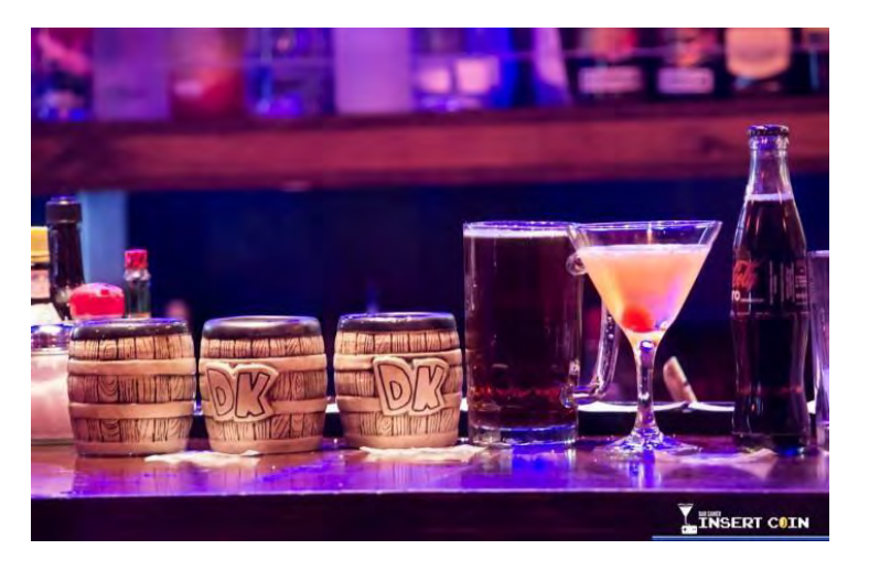
Fig 27. Insert Coin Bar

At the moment I heard about this place, I think "How it's possible that I have not thought about before?. Yes, Insert Coin is one of not-•-thinked ideas: a theme bar about videogames. It looks like a regular bar, but it have a gamer stetic, some couches and LCD TV with videogaming consoles. You can go to drink a cocktail and play FIFA 15 with your friends, or take a gore inspiration and play a Mortal Kombat Tournament, o come back to your childhood and play Mario Kart or Super Smash Bros.