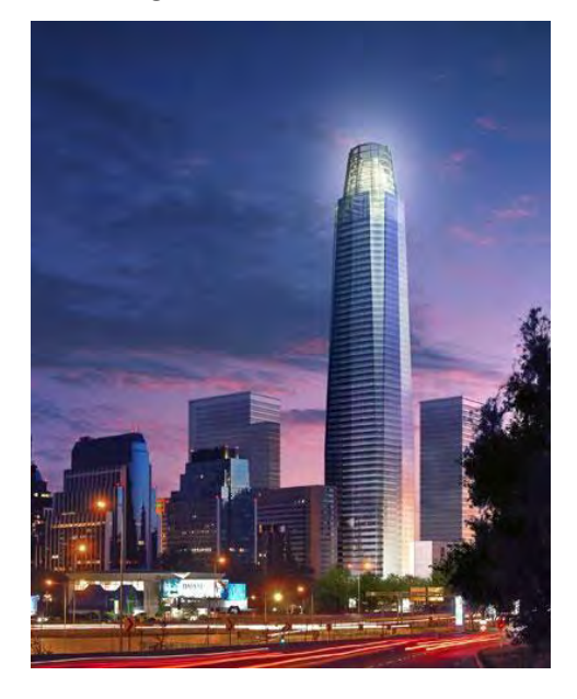
Fig 21. Costanera Center

Web: <a href="http://mall.costaneracenter.cl/">http://mall.costaneracenter.cl/</a> Map: <a href="https://goo.gl/maps/slwtv">https://goo.gl/maps/slwtv</a>