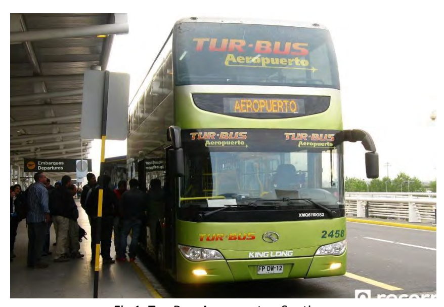
Fig 1. Tur-Bus, Aeropuerto - Santiago

The bus stops in three terminal stations in Santiago, which are Pajarito terminal, San Borja terminal and Alameda terminal. All of them are next to a subway station, which are Subway station Pajarito, Subway station Las Rejas, Subway station Universidad de Santiago (Line 1 or red). In any of these stations, you can get to the GP Venue and/or Judge Hostel.