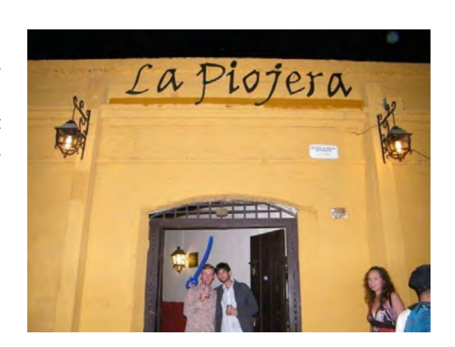
Fig 25. La Piojera

One the most famous "picadas" in Santiago, La Piojera is a bar full of mysticism and tradition, where you can taste typical Chilean drinks, at very affordable prices. It is located in front of the Central Market, just a few steps from the metro station "Puente Cal y Canto", Aillavilu 1030.