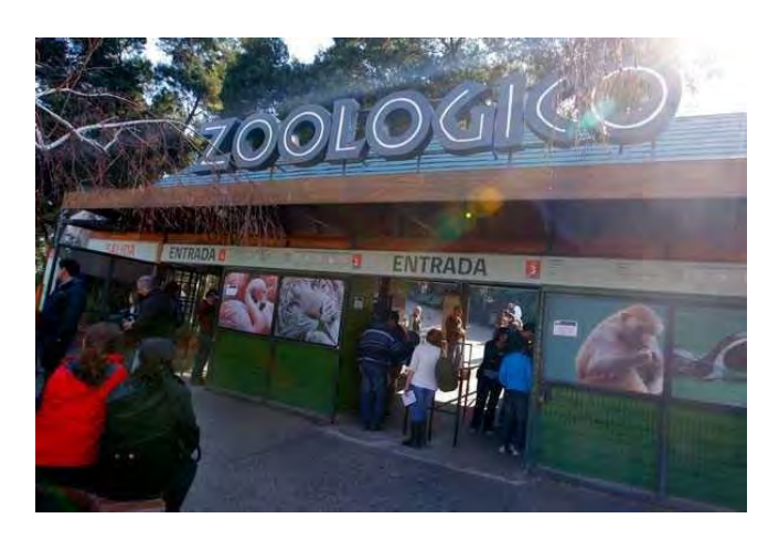
Fig 16. Chilean National Zoo

Web: <a href="http://www.parquemet.cl/">http://www.parquemet.cl/</a> Map: <a href="https://goo.gl/maps/bUHym">https://goo.gl/maps/bUHym</a>