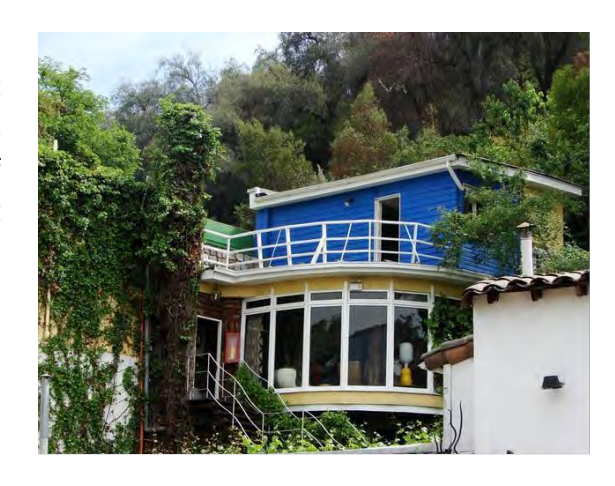
Fig 20. La Chascona

Web: <a href="http://www.fundacionneruda.org/en/la-chascona/visitors-information">https://www.fundacionneruda.org/en/la-chascona/visitors-information</a> Map: <a href="https://goo.gl/maps/DQz6k">https://goo.gl/maps/DQz6k</a>