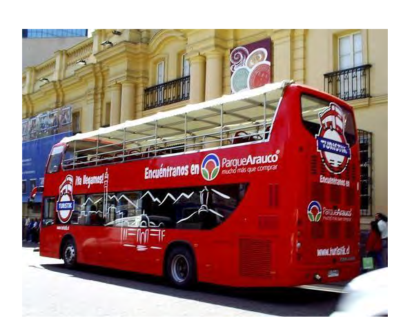
Fig 23. Turistik Bus

http://www.turistik.cl/tour/santiago-city-tour-tradicional.