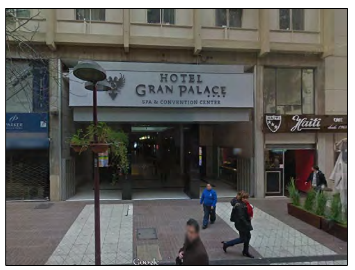
Fig 9. Hotel Gran Palace