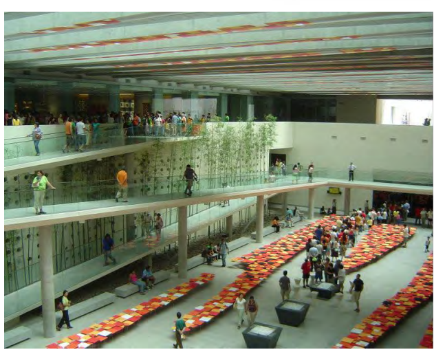
Fig 17. Palacio de La Moneda Cultural Center