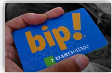
Fig 2. Bip! Card.

The bus service of Transantiago works the 24 hours of the day (in the night the services is less frecuent). The subway station service works from 06:00 to 23:00 hrs.