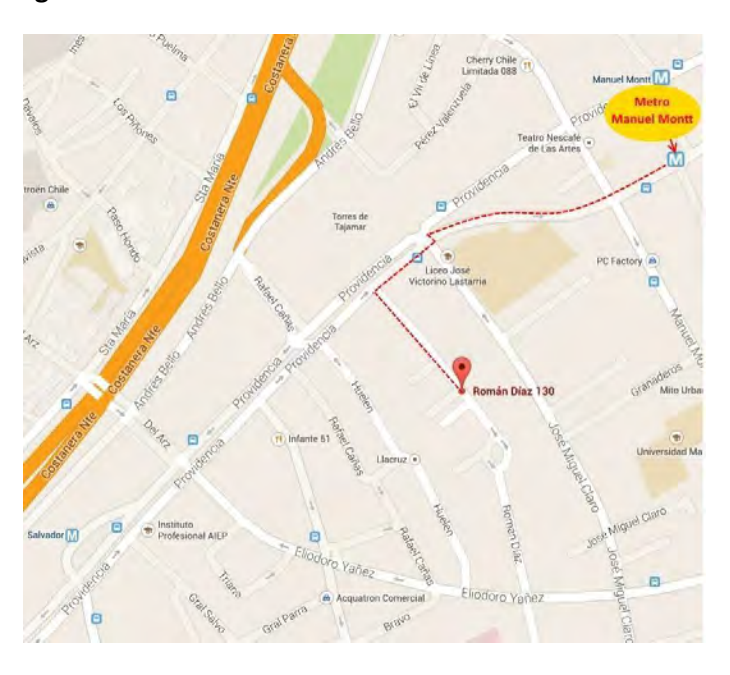
Fig 8. Atacama Hostal, route to follow.

You will find the street Nueva Providencia, then you have to walk west until you find the crossroad with José Miguel Claro, then cross to the south sidewalk of Nueva Providencia, keep going west one block and you will find the street Ramón Díaz, there turn south, walk 200 meters by this street and you will find the Atacama Hostel.