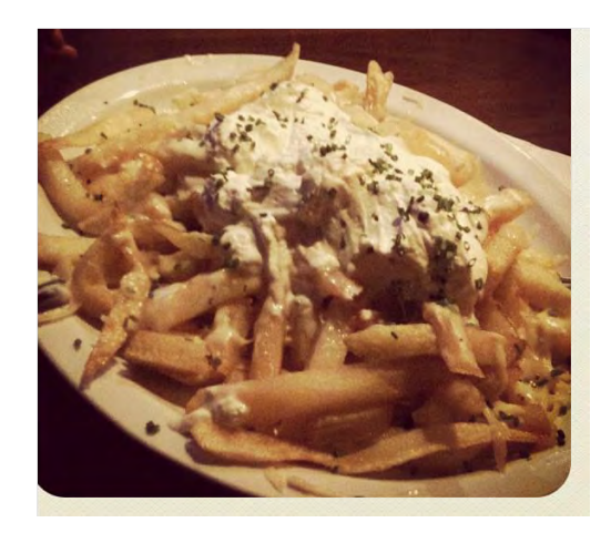
Fig 29. Teclados Bar

There is a pub called "Teclados", which is located a few blocks heading south away from the metro station "Manuel Montt" (Line 1). This pub, apart from offering any kind of drinks and typical food, it characterizes for offering some extremely delicious French fries. The most common ones bring sour cream, cheese, meat, and ciboulette in perfect proportions. It is the ideal place to go with some friends to eat and have a drink. The dish shown on the figure costs around 10 dollars, and it is meant to be for 2 people.