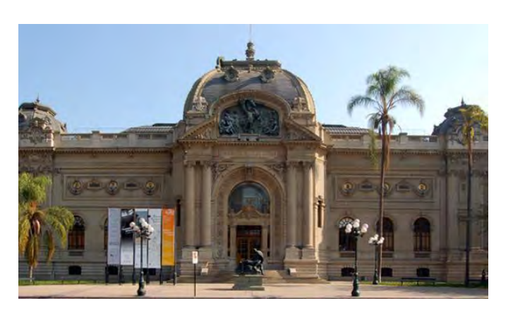
Fig 15. National Museum of Fine Arts

Map: <a href="http://goo.gl/maps/KX7hC">http://goo.gl/maps/KX7hC</a>