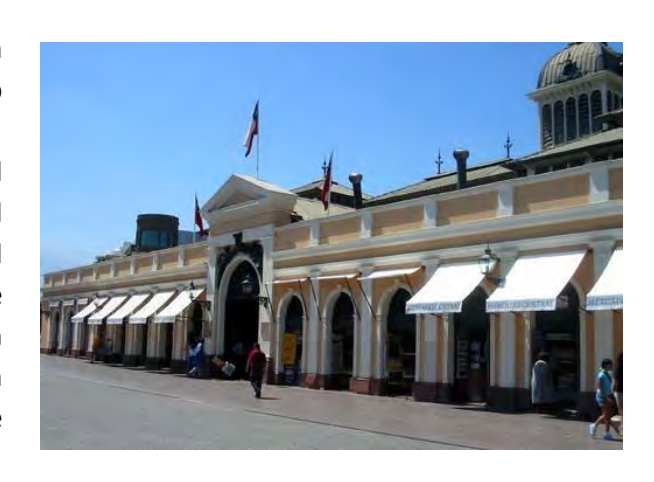
Fig 28. Central Market

"This place is known for offering the most typical and traditional dishes, seafood and river nearby local fruits, an offer related to the quality, freshness and seasonality of food. Here definitely converge people from different walks of life, showing the peculiar form of the Chilean mischief. Definitely a place worth visiting whether for everyday shopping, learning more about our culture, gastronomy, typical items, or just to walk around and share."