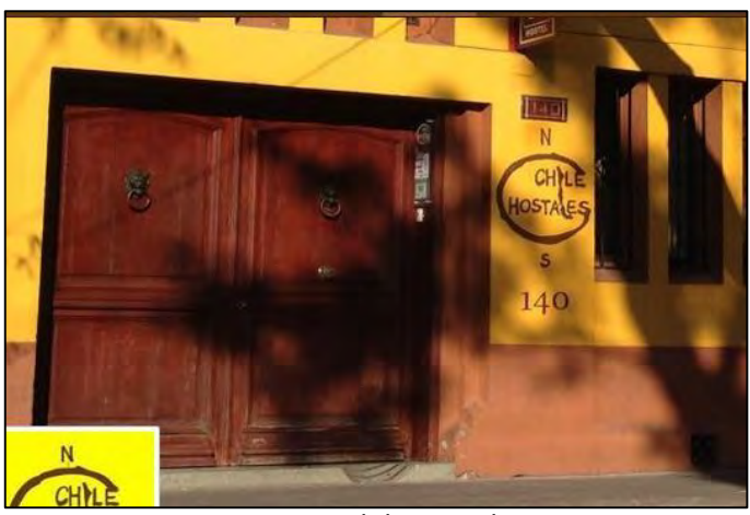
Fig 13. Chile Hostal