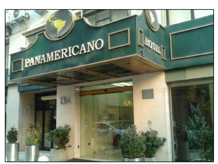
Fig 10. Hotel Panamericano