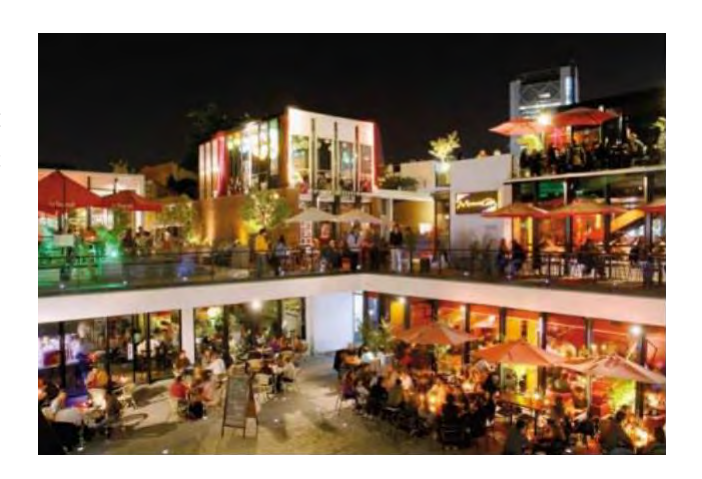
Fig 24. Patio Bellavista

Located between Santiago and Recoleta, it is the most representative artistic place in the city, although at the beginning —early 19<sup>th</sup> century-•- it characterized for being a catholic an aristocratic zone. Nowadays, popular bars, cultural centres and international gastronomy coexist, with the crowded Pio Nono Street as their spinal column. The most famous places to visit are Club La Feria, Club Surreal, Club Dominica 54, Ex Oz, and Patio Bellavista, a highly visited cultural centre that also has restaurants. It is only a few steps from the metro station "Baquedano" (Line 1), north from Pio Nono Bridge.