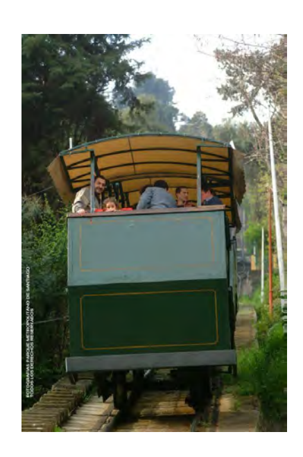
Fig 18. Funicular Santiago

Web: <a href="http://funicularsantiago.cl/">http://funicularsantiago.cl/</a> Map: <a href="https://goo.gl/maps/jyVU5">https://goo.gl/maps/jyVU5</a>