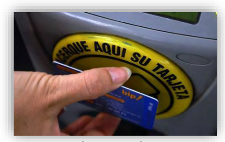
Fig 4. Subway Card system.