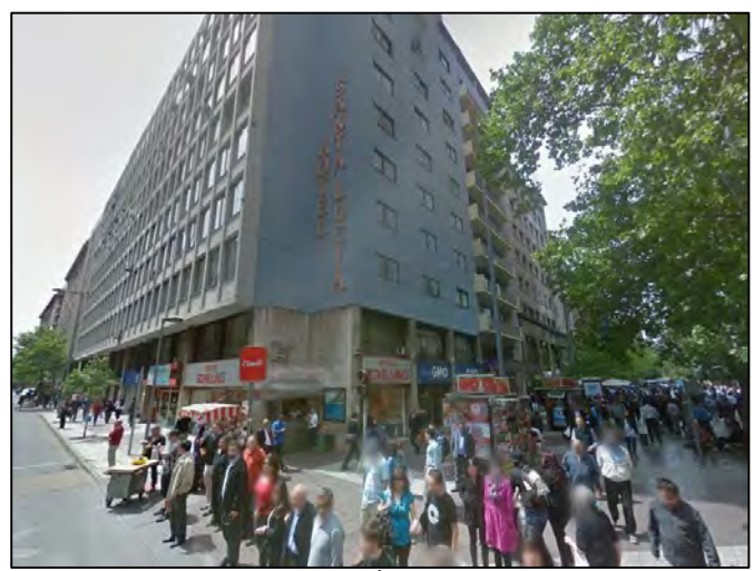
Fig 11. Hotel Santa Lucia