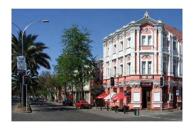
Fig 19. Barrio Brasil

It is a historical neighborhood which is considered national heritage, since it combines neogothic architecture with the Chilean neoclassic style. The neighborhood was home of the aristocracy during the mid---19<sup>th</sup> century. However, in the 1940s, rich people moved towards the east part of the city, leaving those huge households in oblivion. Nowadays it has been renewed, holding cultural and art spaces, nightclubs, restaurants, cafés, and pubs. If you are looking for dancing, having fun, and enjoying the local gastronomy, then Barrio Brasil is your place! It is located on the heart of Santiago, at "Cumming" station (Line 5).