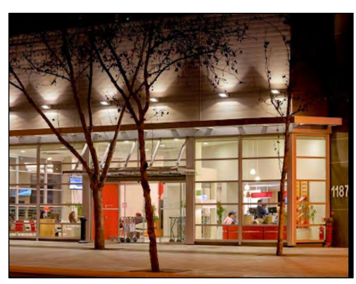
Fig 12. Hotel Ibis