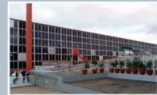
Pabellón de Cristal