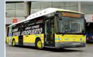
Bus for Airport