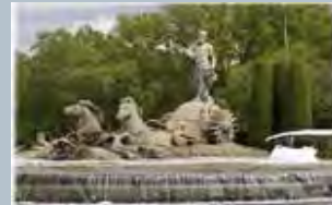
Fuente de Neptuno