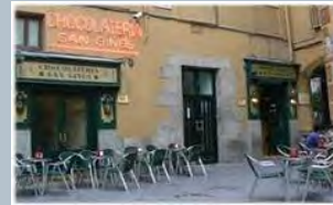
Chocolateria San Ginés

Pasadizo San Ginés, 5 – Near Plaza Mayor