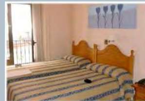
Hostal Santa Cruz