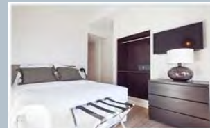
Hotel Acta Madfor

~ Walking: near 2,5Km and 30-35 minutes.