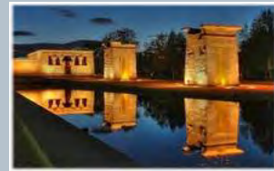
Templo de Debod

On the west side of Plaza de España near Paseo del Pintor Rosales