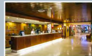
Hotel Celuisma Florida Norte

~ Walking: near 2,5Km and 30-35 minutes.