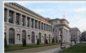
Museo del Prado

Museo Reina Sofia: www.museoreinasofia.es/en Address: Calle Santa Isabel, 5 Metro: Atocha (L1) Timetable: 10:00-21:00 (until 19:00 on Sundays, closed on Tuesdays) Phone: +34 917741000