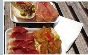
El Capricho Extremeño

Underground: Lines 1 (Antón Martín), 2 (Sevilla) or 3 (Lavapiés).