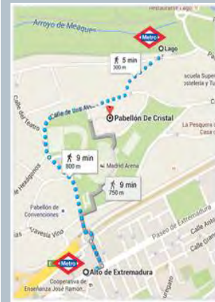
Metro Stations near the event