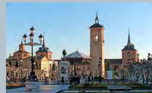
Alcalá de Henares

Arrive at this city in around 1 hour and a quarter by train (C-2, C-7), transferring from underground L10.