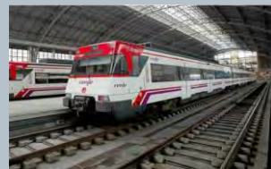
Cercanías Train System