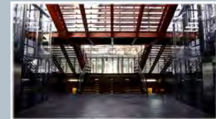
Pabellón de Cristal