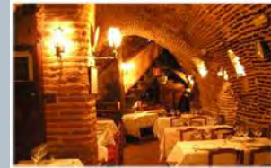
Sobrino de Botín