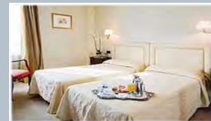
Hotel Principe Pio

~ Walking: near 2,5Km and 30-35 minutes.