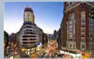
La Gran Vía