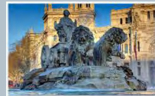
Fuente de Cibeles