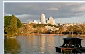
Casa de Campo

You can get a subscription card to visit several museums, (El Prado, Thyssen Bornemisza and Reina Sofia) called Paseo del Arte: 25,6€.