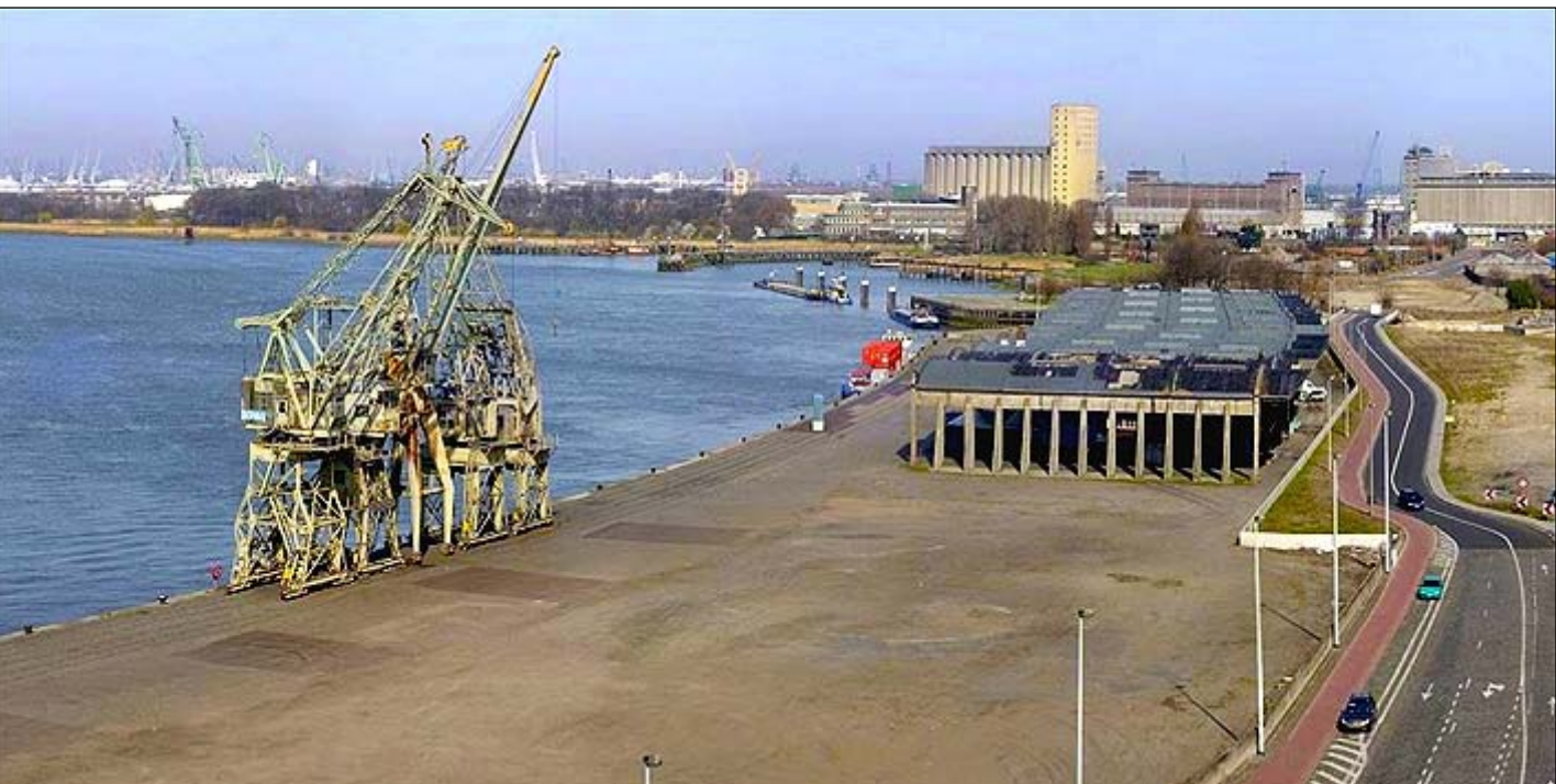
The waagnatie building with parking space