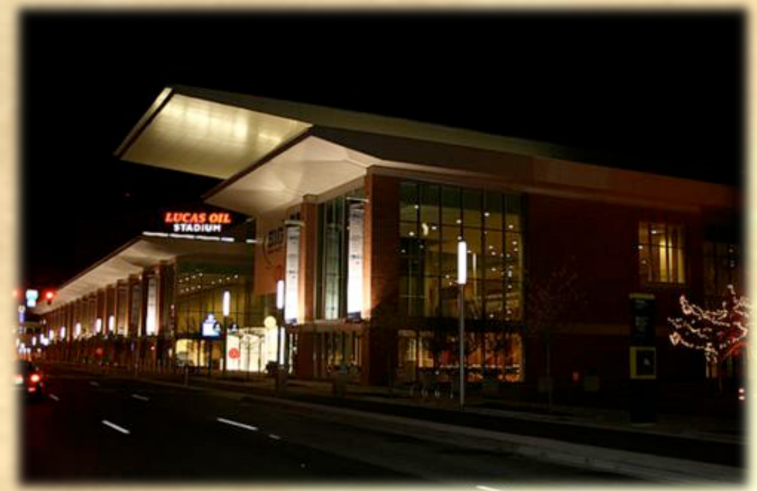
Indianapolis Convention Center & Lucas Oil Stadium

100 South Capitol Avenue, Indianapolis, IN 46225