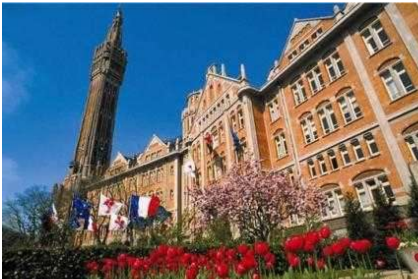
The Town Hall, and his famous Belfroi tower

If you're looking for a cheap takeaway meal, you can easily find a cold one in a convenience store. There are lots of sandwiches and take away stores open late at night in Lille Railway district streets.