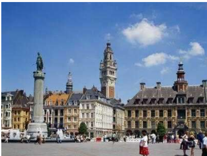
The « Grand Place », Lille downtown

French players can understand most Magic words in English, such as tap, untap, instant, stack, damage, mulligan, life, and so on. You can normally play a game with a French player without having to say anything in French. However, you might want to know some French sentences used by local players. Here they are, along with some other useful phrases: