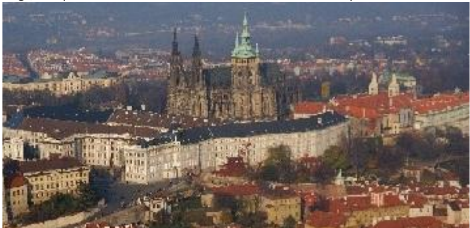
Various architectural styles can be seen at the place.

Founded more than thousand years ago, the castle has been the residence of emperors, Bohemian kings, and presidents of Czechoslovakia and of the Czech Republic.