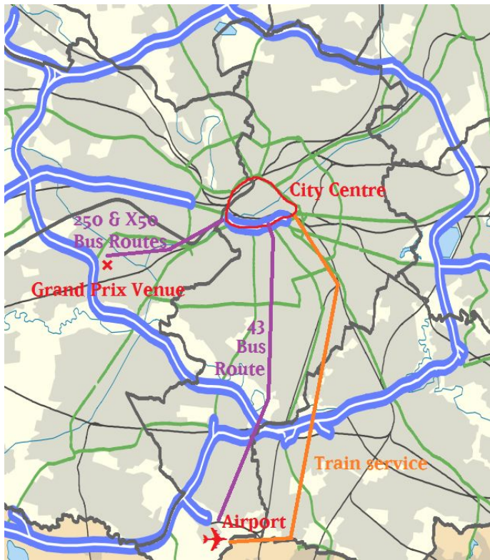
Rough map of the City

Check out Page 29 for the recommended Airport to venue route.