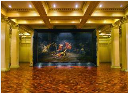
13ft x 22ft "Spolarium" by Juan Luna at the National Museum of the Philippines

You might be here purely to work at Grand Prix Manila; get in when it starts and fly out as soon as it's over. Maybe you heard about all the great tourist spots and decided to fly in earlier (or leave after a few more days) to go around outside of the event schedule. Perhaps you'll head out and enjoy the night life after each day's proceedings and want to know how to get there. Or maybe you just want to know where the good places to eat are. Whatever your needs may be, we've got the most important information covered in this guide, compiled by a group of Filipino Judges.