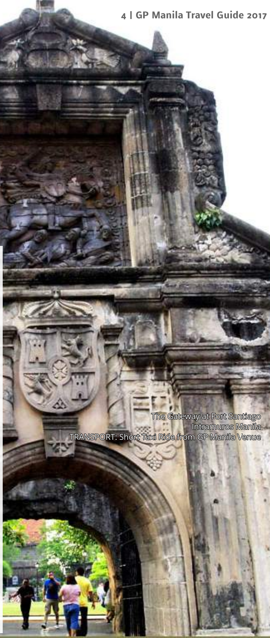
The Gateway at Fort Santiago Intramuros Manila

During your stay, it is recommended that one brings a pocket umbrella in case of sudden rain, a water bottle to stave off the heat, and hand towel or change of clothes for when you are wet with sweat or rain.