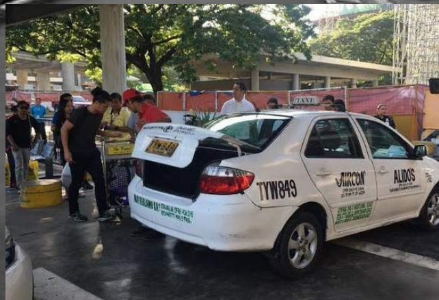
NAIA Terminal 3 Arrival Area and Parking Lot

Located across Bay 8 in the open parking lot, the metered (white) taxi bay offers a cheaper alternative to pricier airport and chartered taxis.