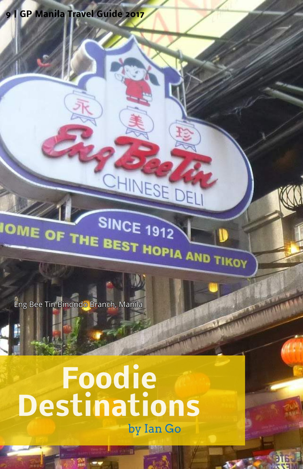
Eng Bee Tin Binondo Branch, Manila