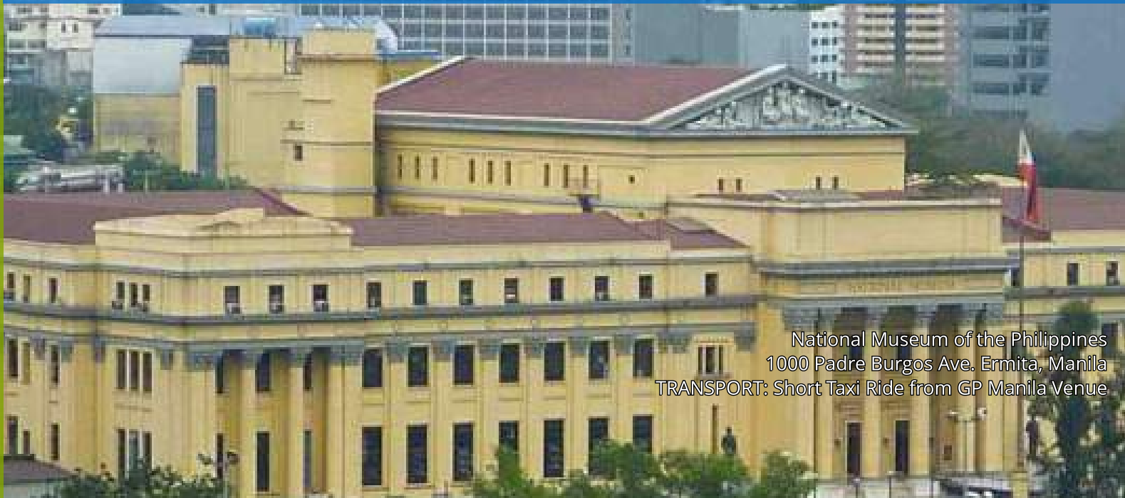
National Museum of the Philippines 1000 Padre Burgos Ave. Ermita, Manila TRANSPORT: Short Taxi Ride from GP Manila Venue

You might be here purely to work at Grand Prix Manila; get in when it starts and fly out as soon as it's over. Maybe you heard about all the great tourist spots and decided to fly in earlier (or leave after a few more days) to go around outside of the event schedule. Perhaps you'll head out and enjoy the night life after each day's proceedings and want to know how to get there. Or maybe you just want to know where the good places to eat are. Whatever your needs may be, we've got the most important information covered in this guide, compiled by a group of Filipino Judges.