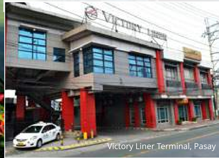
Victory Liner Terminal, Pasay

There are two ways to go to the said terminal: taxi, or bus. Via taxi (fare range is Php 100 - 200), you just tell the taxi driver the said location. Most taxi drivers know this place so you don't have to worry much of getting lost. Via bus from SM Mall of Asia (fare range is Php 12 - 15), just ride any bus going to North (ex. Cubao, Fairview, Ayala, Ortigas) and let the Ticket Inspector know that you will be getting off at Victory Liner Terminal in Pasay .