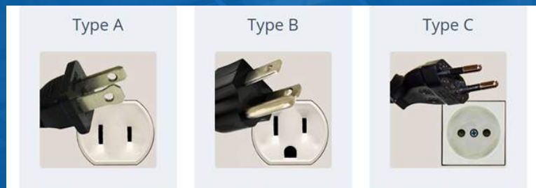
3 types of sockets used in the Philippines

TRANSPORT: Short Taxi Ride from the Airport (4.4km)