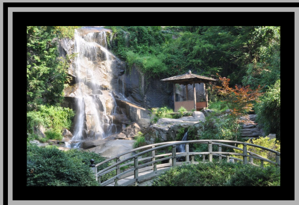
Maymont - An old Victorian estate turned park. It contains several gardens and amazing architecture