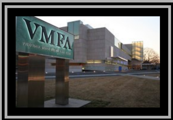
Virginia Museum of Fine Arts - Awesome art, free admission, open every day

Since Richmond is an old city (relative to most US cities) as well as a city that has experienced significant cultural growth over the last few years, there are several potential tourist destinations and opportunities: