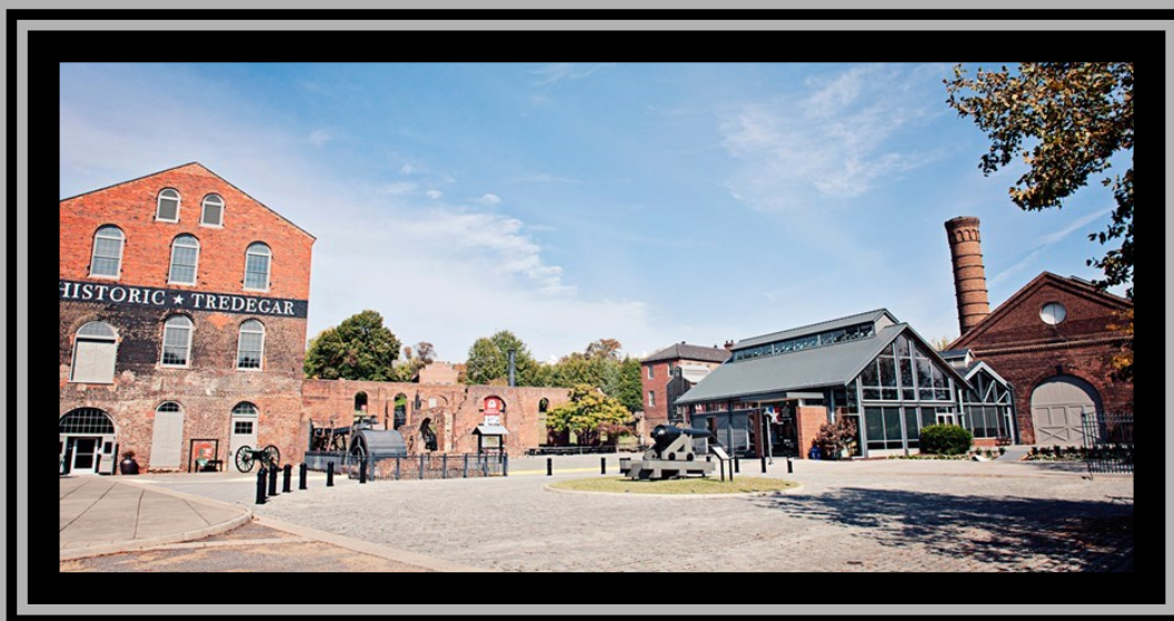
American Civil War Museum