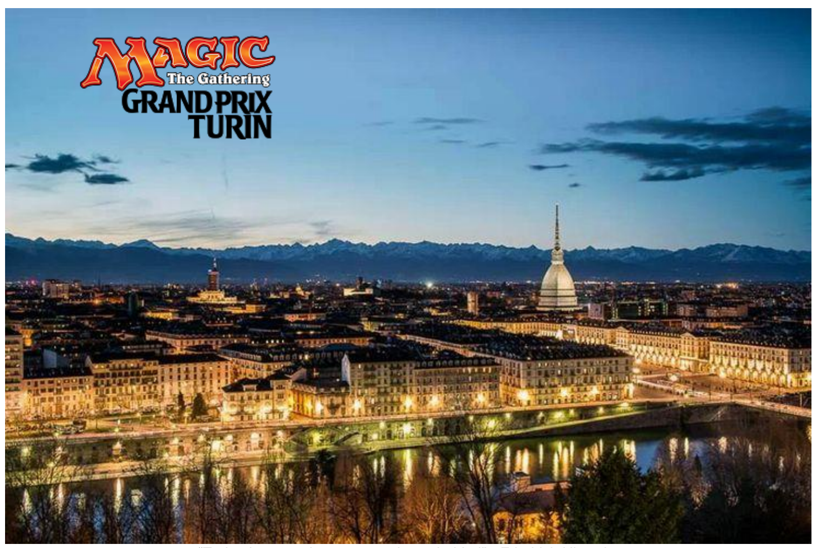
"Torino is not a place you can leave behind" - Friedrich Nietsche