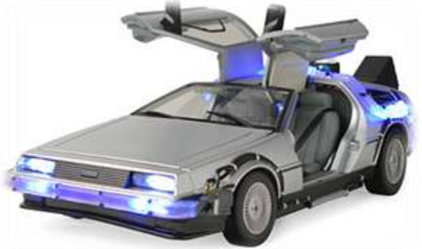
Back to the future to GP Lille

Eurotunnel Le Shuttle offers a fast and frequent service from Folkestone to Calais in just 35 minutes and with up to 4 shuttle departures an hour. Lille is only an hour and a half drive from the Eurotunnel Calais Terminal on the A26 motorway. For more information : 08443 35 35 35 (from the UK) or 0810 63 03 04 (from France). www.eurotunnel.com