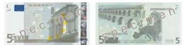
old 5 euros bills