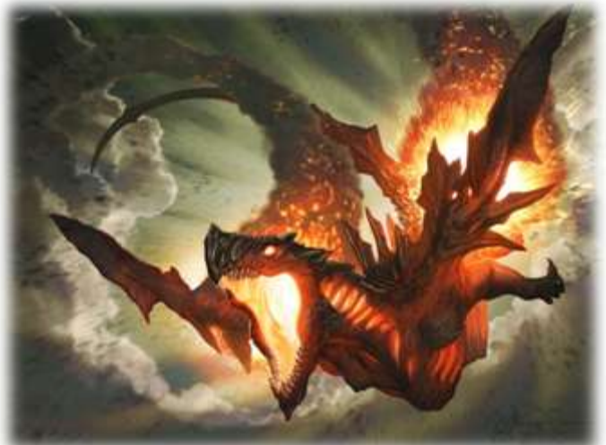
Dragon airlines to GP Lille

Eurotunnel Le Shuttle offers a fast and frequent service from Folkestone to Calais in just 35 minutes and with up to 4 shuttle departures an hour. Lille is only an hour and a half drive from the Eurotunnel Calais Terminal on the A26 motorway. For more information : 08443 35 35 35 (from the UK) or 0810 63 03 04 (from France). www.eurotunnel.com