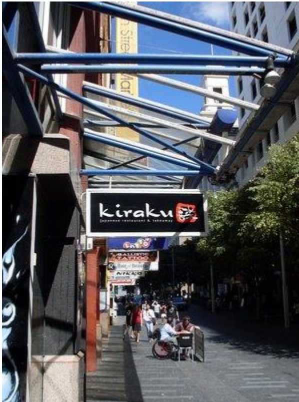
Kiraku Japanese Restaurant ($10-15) - Mid City, Elliot Street, Auckland CBD, Auckland

Disclaimer: the store is tiny. Known for their gyoza (fried dumplings). Either have them by themselves or grab a bowl of ramen alongside.