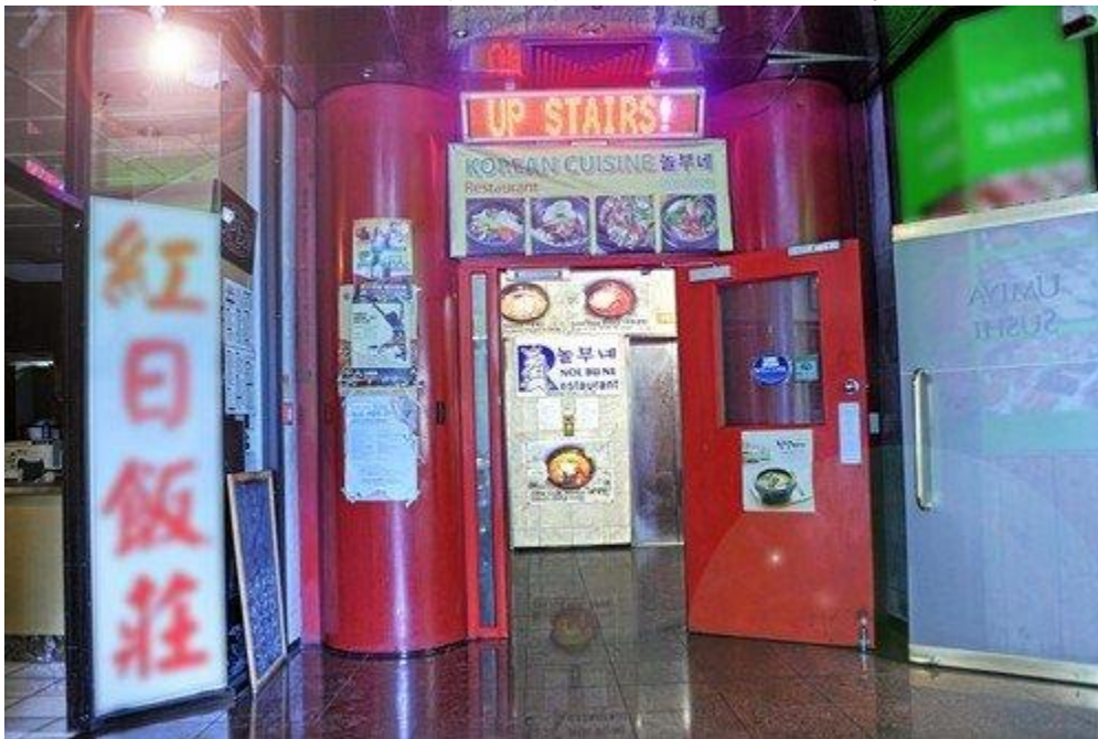
Nol Bu Ne Korean Restaurant ($10-20) - level 2, 10 Wellesley Street East, Auckland 1010

Disclaimer: the store is tiny. Known for their gyoza (fried dumplings). Either have them by themselves or grab a bowl of ramen alongside.