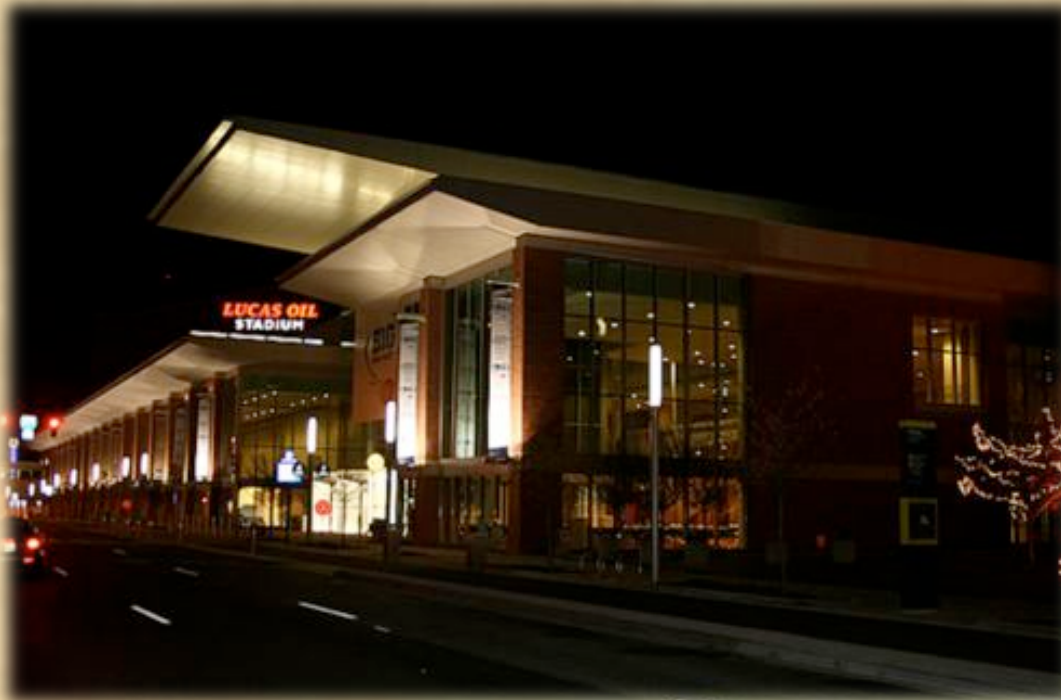
Indianapolis Convention Center & Lucas Oil Stadium 100 South Capitol Avenue, Indianapolis, IN 46225